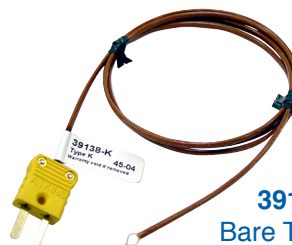
39138-K Bare Tip Probe