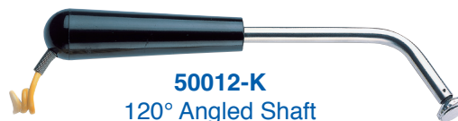
50012-K 120° Angled Shaft Surface Bell Probe