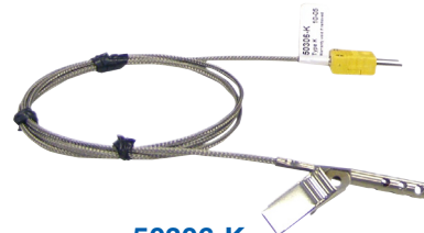
50306-K Oven / Freezer Probe