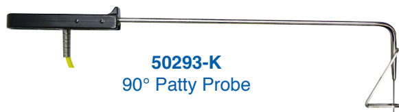
50293-K 90° Patty Probe