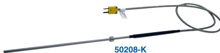
50208-K Fry Vat Probe