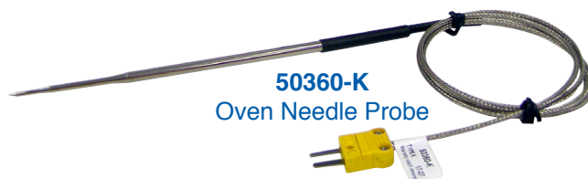
50360-K Oven Needle Probe