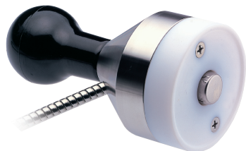
50014-K Weighted Griddle Surface Probe